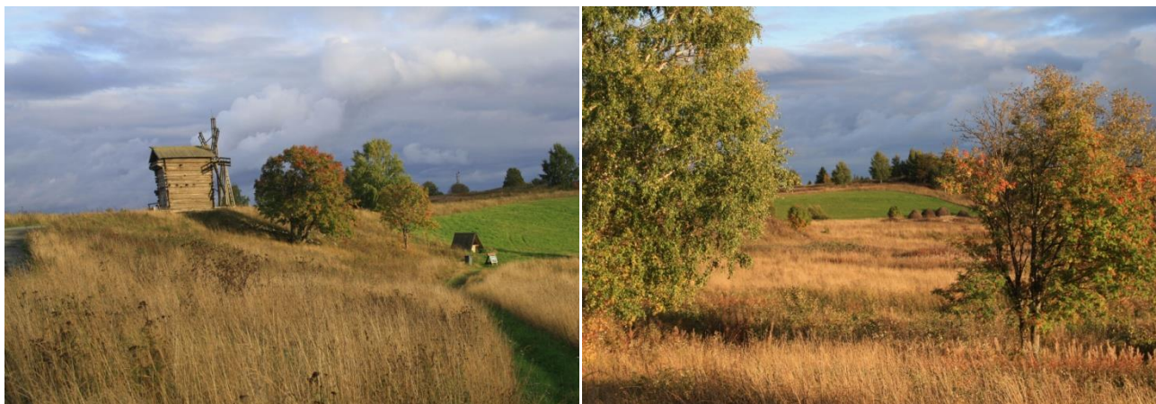
Fig.5. Target condition: desirable visual landscape pattern of Kizhi determined by the combination of hay field and tree alleys and small tree-bush groups

The following step - determination the specific of influence concerning the above mentioned landscape components which are considered in this case as the "details" of a visual scene capable to change the elementary and composite properties [16, 21]. It is the most difficult to estimate transformation of composite aesthetic properties, in particular so-called "pattern" - a mosaic of fields, meadows and bogs.