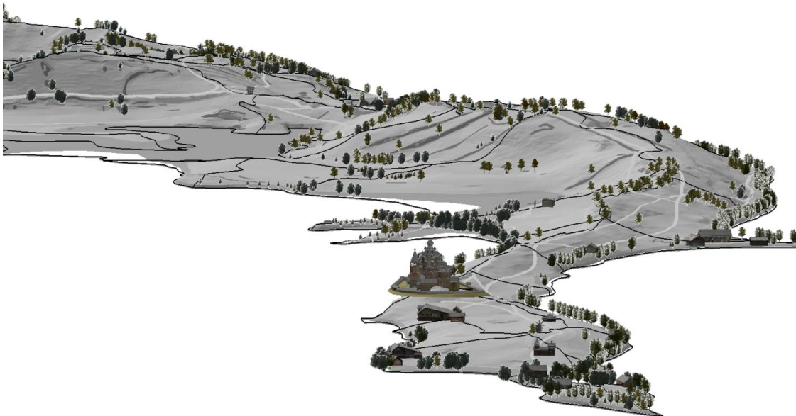
Fig.3. 3-D model of Kizhi island executed with the ArcScene toolset GIS ArcMap 10.0

For further studying of the visual roles of separate landscape's components special 3-D model of Kizhi-island have been constructed in the ArcMap ArcScene. The aim of modelling was to reproduce the significant feature of relief (levels of terraces, tops and slopes of various steepness, ledges and buttresses, stone ridges), vegetation cover (accent trees, coastal tree-lane, wood and shrubby tree-groups, meadows of various type) and above all – churches, chapels, rural log huts, windmills and smithies. Then to a 3D model the layers displaying movement of tourists and shoot points are added. By means of detailed cameral analysis of the fotofixing landscape scenes in comparison to three-dimensional model of the Kizhi-island the visual functions of various landscape's elements have been determined. It has become clear that the island relief determines a configuration of the viewsheds covering slope's amphitheatres, and the flat surface of lake terraces. Internal (within viewsheds) filling of scenes is almost entirely determined by a vegetation condition: meadows create visual "floor", dense spherical volumes of bushes, separate trees – accents and focuses at average and front plans, coastal alleys - a side curtain, forest track – edges and "walls" of distance scene with expressed background. The vegetation generally controls property of "openness closeness" of viewsheds: so half-open landscapes can represent meadows with single curtains, or glade with regularly placed trees [6].