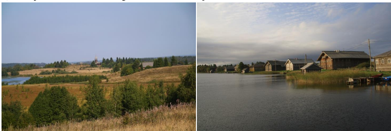
Fig. 2. Two different types of landscape scene: scenes with several well expressed plans landscape features (left) and scenes observed from the lake's water area (right)