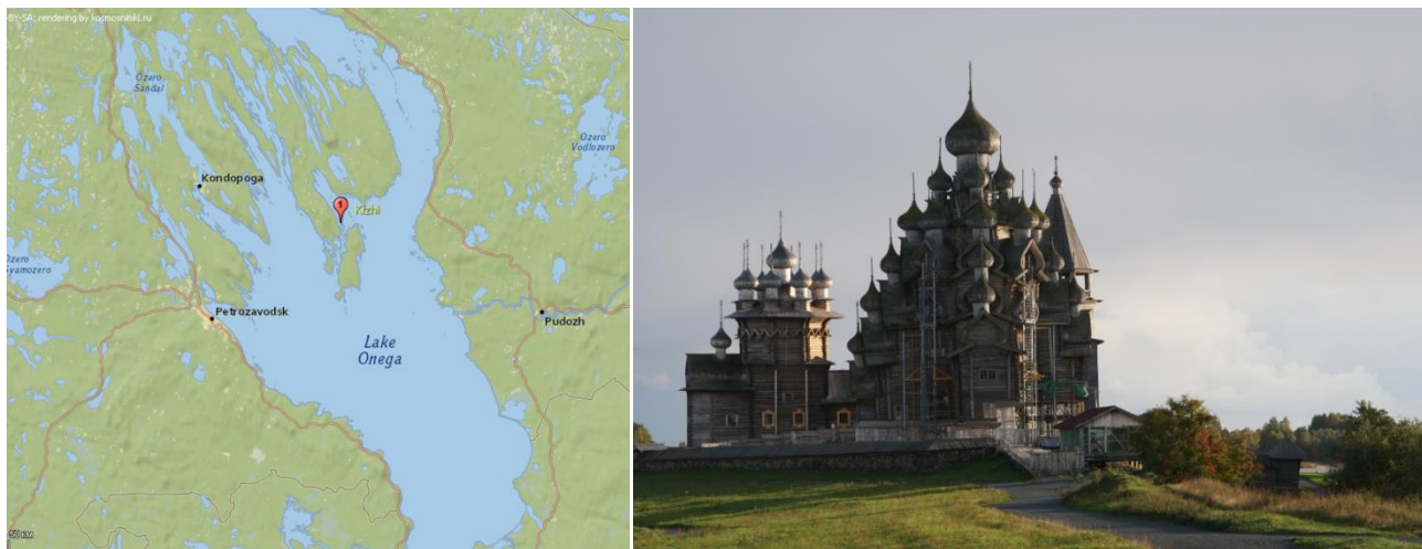
Fig.1. Kizhi island in northeast part of Lake Onega (left); Church of the Transfiguration – the main monument on the UNESCO World Heritage Site (right)

The Kizhi Museum is one of the largest open air museums in Russia. This unique historical, cultural and natural complex is a particularly valuable object of cultural heritage of the peoples of Russia. The basis of the museum collection – the Kizhi Ensemble – is the UNESCO World cultural and natural heritage site. Kizhi – the central island of the archipelago "Kizhsky shkher" located in northeast part of the water area of Lake Onega (fig. 1, left).